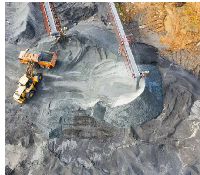
Mineral Resources Refinery Expertise