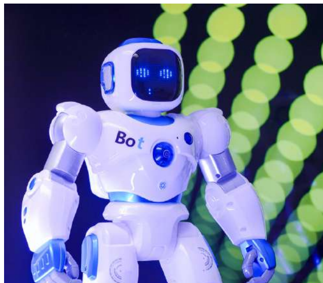
Robotics & Automation Development