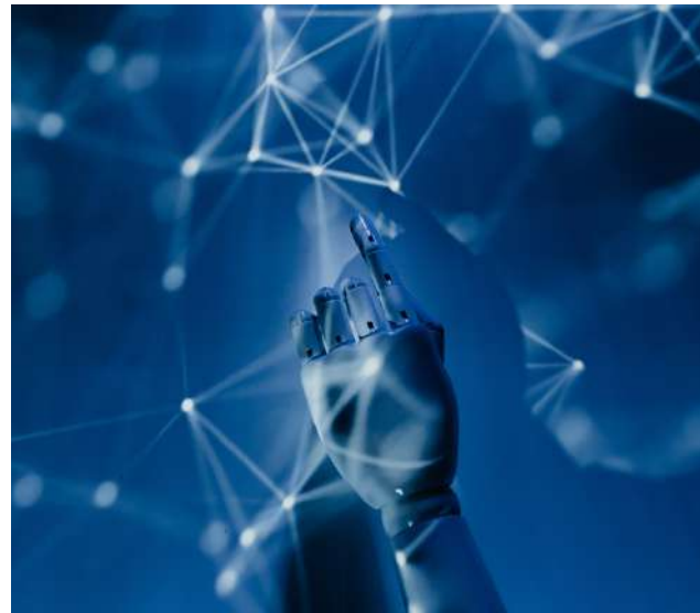
Technology & Innovation: Semiconductor, EV, AI