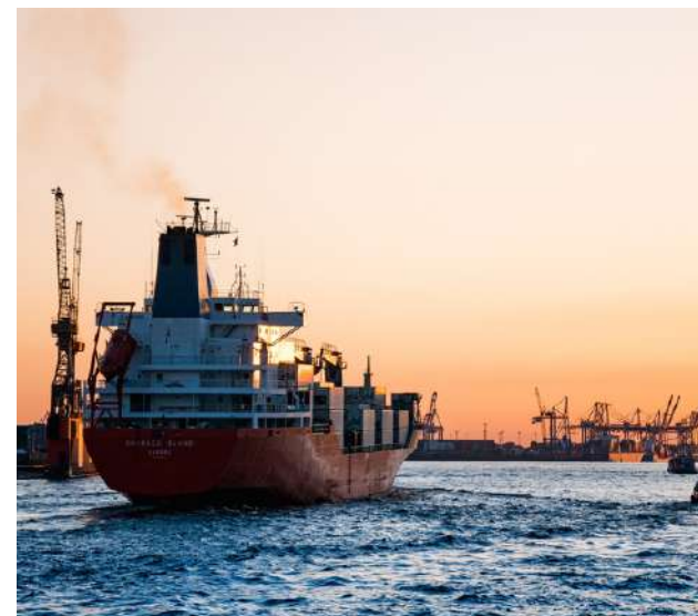
Global Supply Chain & Logistics