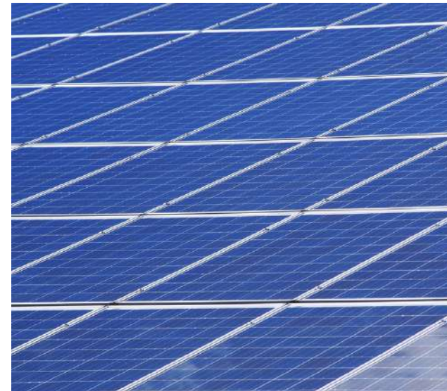
Clean Energy Solutions: Solar, Wind Power