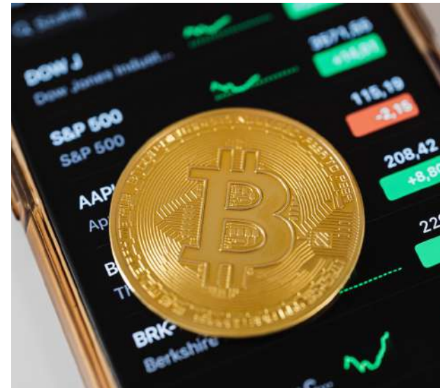
High-Tech Advancements: IT, Communication, Blockchain